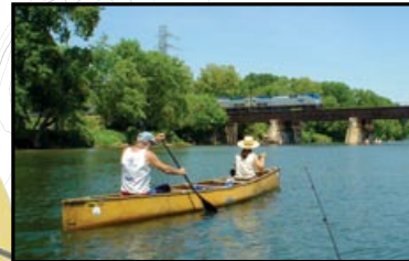
Paddling by train trestle bridge