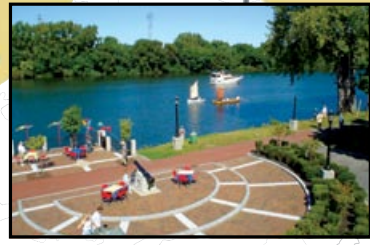
Boats along Riverside Park