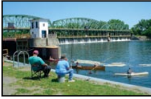
Fishing By Lock 8 in the Town of Rotterdam

Welcome to the Mohawk River/Erie Canal Blueway Trail. The Town of Glenville has partnered with the County of Schenectady and the New York State Department of State to showcase our 18 mile Blueway Trail that winds its way through our historic landscape.